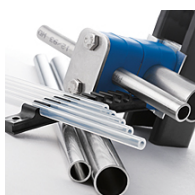
Tubing and Accessories